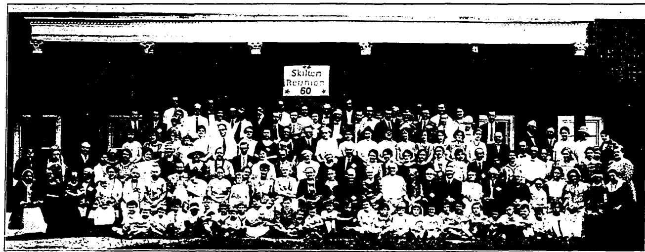
SIXTIETH ANNUAL REUNION, COMMUNITY HALL, WATERTOWN, CONNECTICUT, 19 AUGUST 1925.