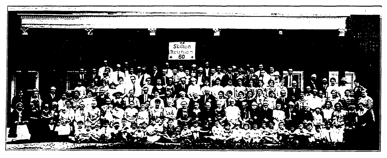
SIXTIETH ANNUAL REUNION, COMMUNITY HALL, WATERTOWN, CONNECTICUT, 19 AUGUST 1925.