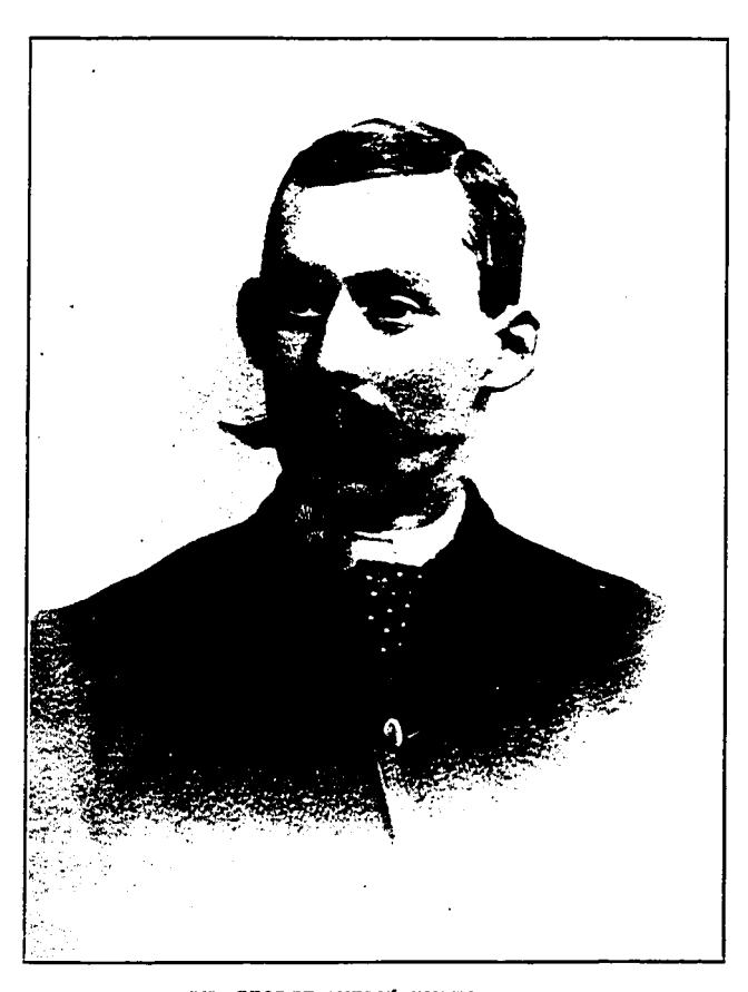
369 GEORGE AVERY SKILTON (1895)